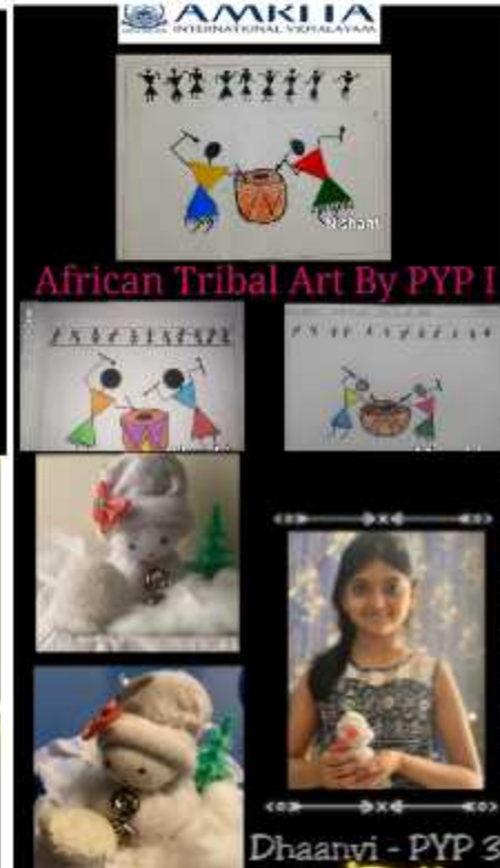
African Tribal Art By PYP 1