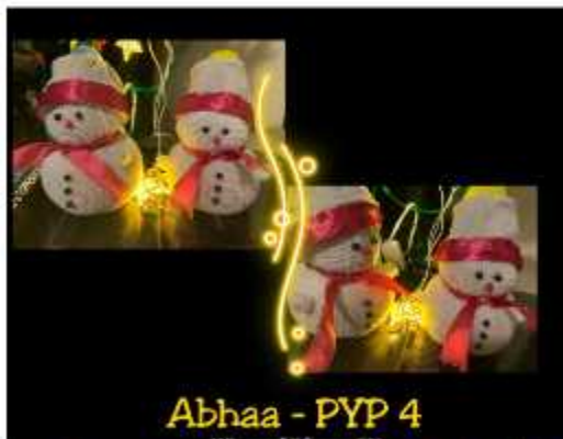
Abhaa - PYP 4

HERE'S A GLIMPSE OF BEAUTIFUL ARTWORK OF OUR FUTURE PICASSOS IN THE MAKING