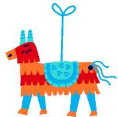
Harshiv - PYP 1